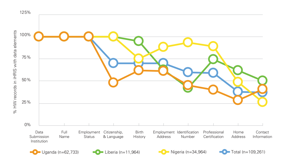
Figure 4. Comparative analysis of the availability of WHO recommended HRH Minimum Data Set in country iHRIS systems

recruitment, deployment and retention practices<sup>3</sup> to better understand trends in migration patterns. A recent rapid review of retention strategies [16] demonstrated that existing indicators are those of process and the need for routine measurement that can define baselines to be retained, at which level of service-provision and for which timeframe. Module 6 on "Labour regulation (national & international employment terms & conditions)" would include extended work with ILO and others on the determinants of the changing profile of employment (fixed, contractual, voluntary, multiple) and the implications on employment stability. Occupational safety of health workers and the growing incidence of violence directed at health care personnel are critical issues which warrant closer consideration as key aspects in monitoring health workforce development in the future [17].